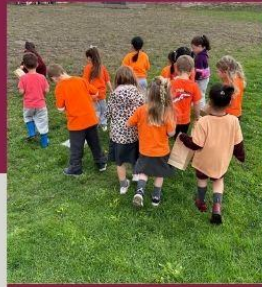
Character & Faith Formation