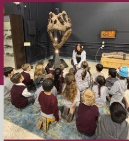
Amazing Extra-curricular Offerings