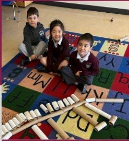
Diverse Population & Centrally Located