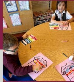
High Academic Standards