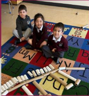
Diverse population & Centrally located