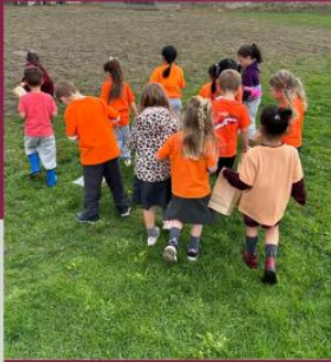
Character & Faith Formation