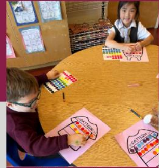
High Academic Standards