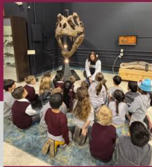
Amazing extra-curricular offerings